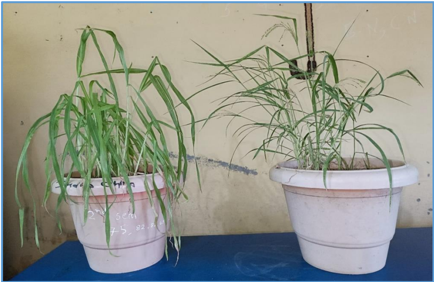
Dudhe chino (left) and mal chino (right)

Both varieties were similar in few traits like nodal roots were observed up to two upper nodes in the main stem, showed up panicles from each of the two to three nodes and posed grains in smooth hulls. In the field condition, Malchino was able to withstand water logging condition as compared to dudhe chino, due to stiffness of the stem. Dudhe chino plant completely decayed, whereas malchino survived showing only 5% filled grains. This might be due to stiff stem and quick maturing nature of the later and succulent, soft stem at early growth stage of dudhe chino. The difference in yield and yield attributing traits are shown in Table 2.