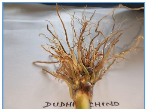
Roots of Malchino on the left and Dude chino on the right