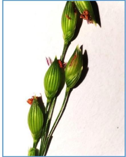
Proso millet (Mal chino) at flowering stage