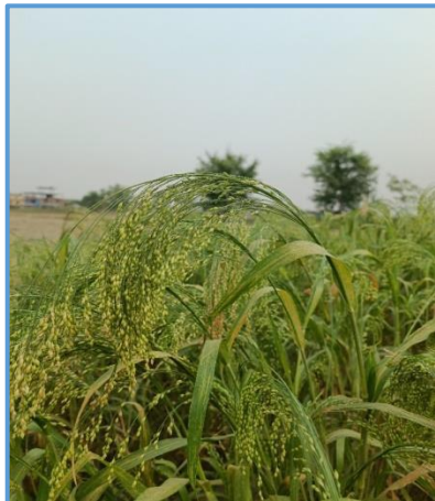
Mal Chino (left) and Dudhe Chino (right) during grain filling stage