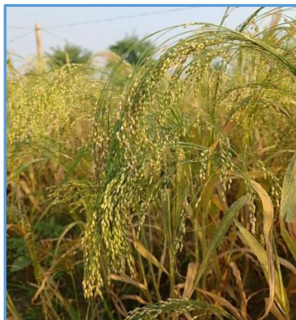
Proso millet at ripening stage

Heaping: The bundle of panicles are heaped together in the dry place under shade for 1-2 days. While heaping, tip of the panicles should face outside and the stalks should be at the center or the inner side to facilitate ripening of the grains. This allows proper aeration in the spikelets which releases excessive moisture from the panicle, before threshing. If heaped for greater number of days, the grains will dry soon and is floured. In Karnali, the panicles are heaped in doko (bamboo basket) tightly and then covered with muslin cloth to facilitate ripening of the grains, which were otherwise green. Such practice aids removal of grains from the panicles.