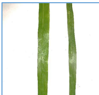
Leaves of Dudhe chino (flat) on the left, and Malchino (narrow) on the right

be digested by all. A study was done in Kailali district, which is at 156.04 masl, to study the morphology, yield and yield attributing traits of both these varieties. The differences between roots, stems and leaves at 55 DAS for the commonly grown varieties i.e., Dudhe chino and Mal chino, in the Far western province are described in Table 1.