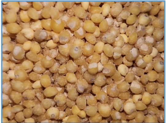
Hulled grains 'chamal'

Dehusking: Proso millet grains are taken out from the storage and dried in the required quantity before hulling. It is generally dehulled using mortar and pestle (Okhal) in different batches at small scale. The hulls are smooth, which can scatter easily when greater pressure is applied. Light pressure should be applied at first till the hulls are separated from grains. Manual dehulling is