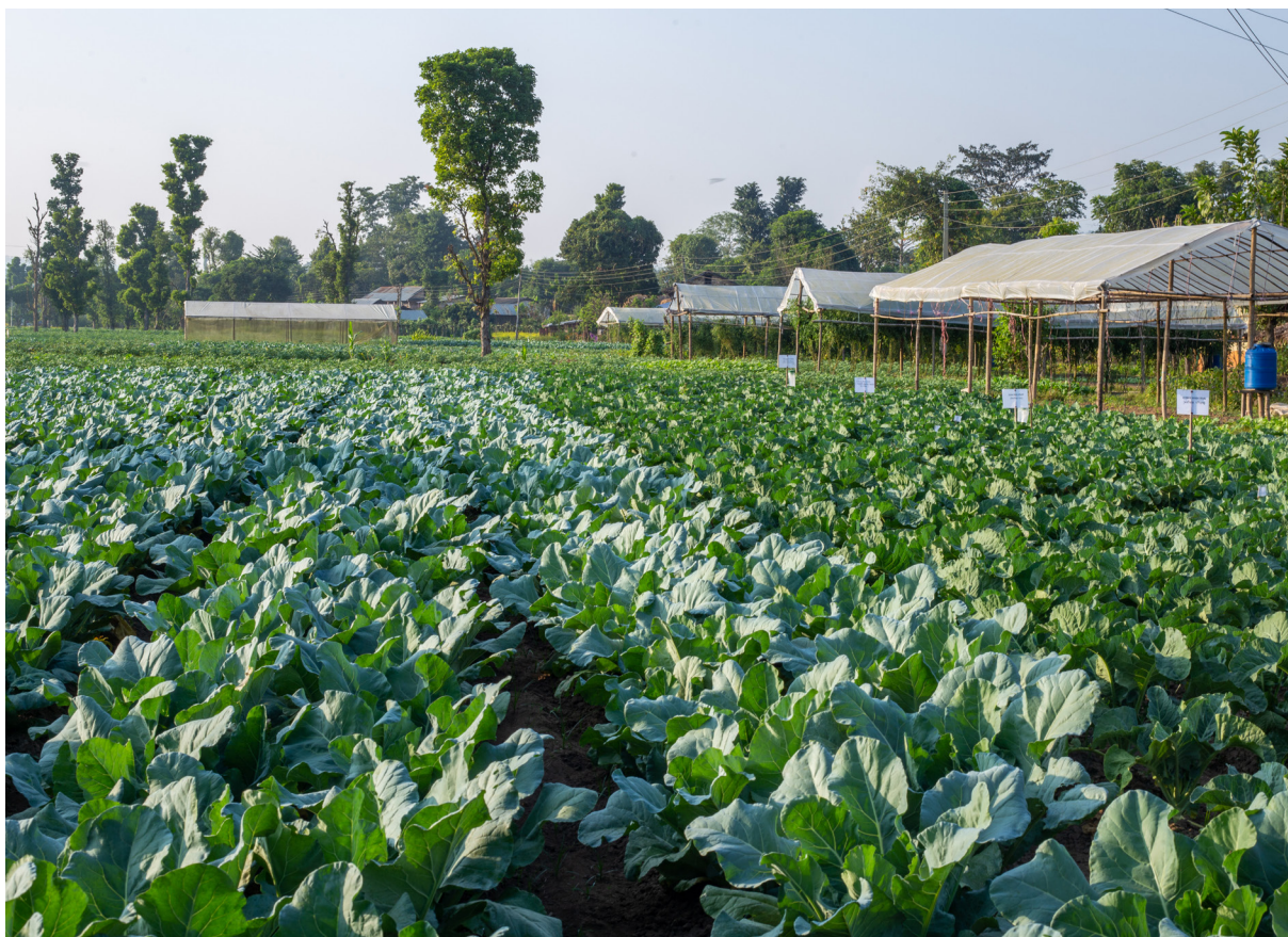
Picture 2: Vermiwash field trial on Cauliflower.

Additionally, plants may exhibit increased susceptibility to pests and diseases, along with poor flowering or fruit production. The overall health of the foliage might suffer, displaying general yellowing or browning. Soil depletion is also a concern, particularly when there's continuous cultivation of crops without adequate nutrient replenishment.