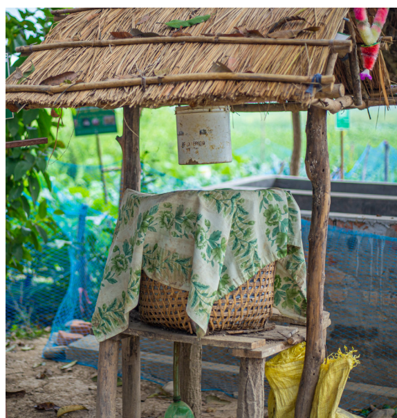
Picture 3: Vermiwash demonstration at community learning centers.

A laboratory analysis was conducted on Vermiwash, which was prepared in a farmer's field using cattle dung, leftover fodder, and vermicompost as feed. The nutritional composition is presented in Table 1. The Vermiwash sample, which was one week old, was analyzed for various nutrients using different methods.